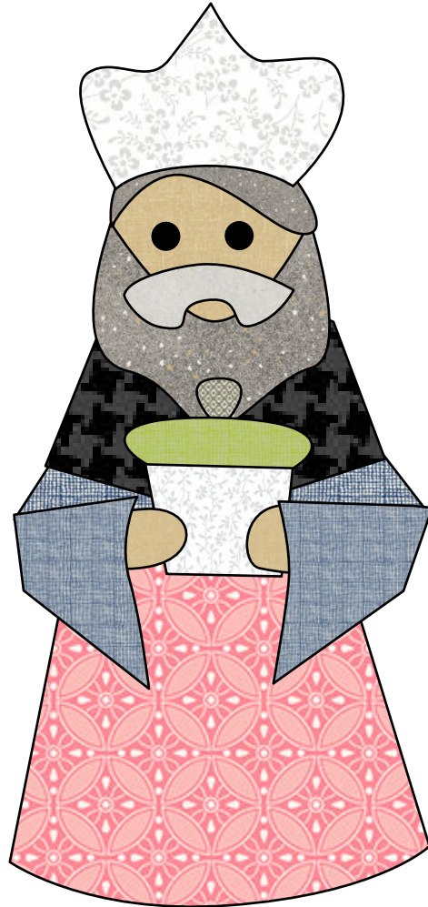
Nativity C - design 349 of 365