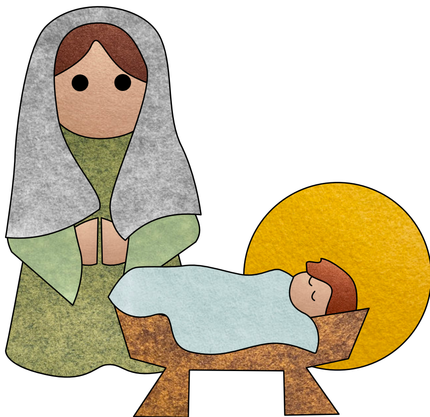
Nativity A - design 347 of 365