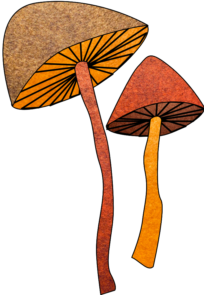
Mushroom D - design 289 of 365