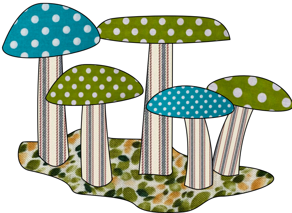
Mushroom C - design 288 of 365