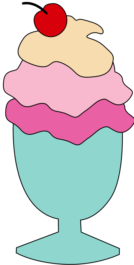
Ice Cream F - design 248 of 365