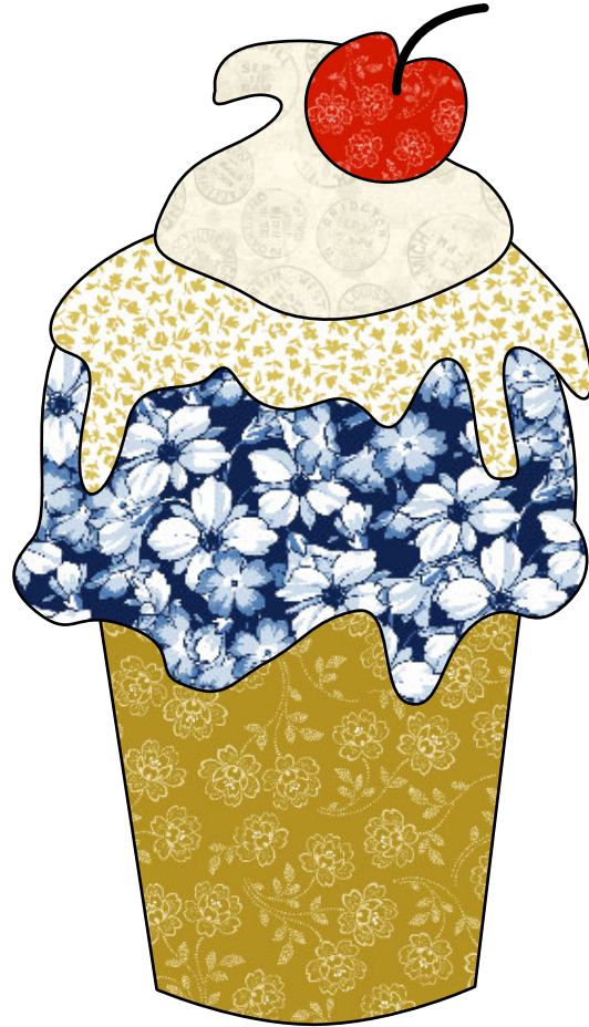
Ice Cream E - design 247 of 365