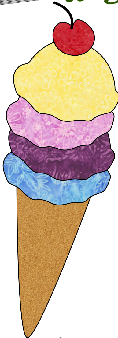
Ice Cream D - design 246 of 365