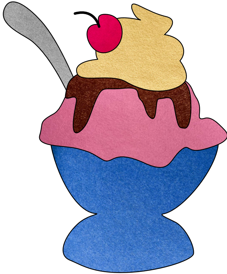
Ice Cream A - design 243 of 365