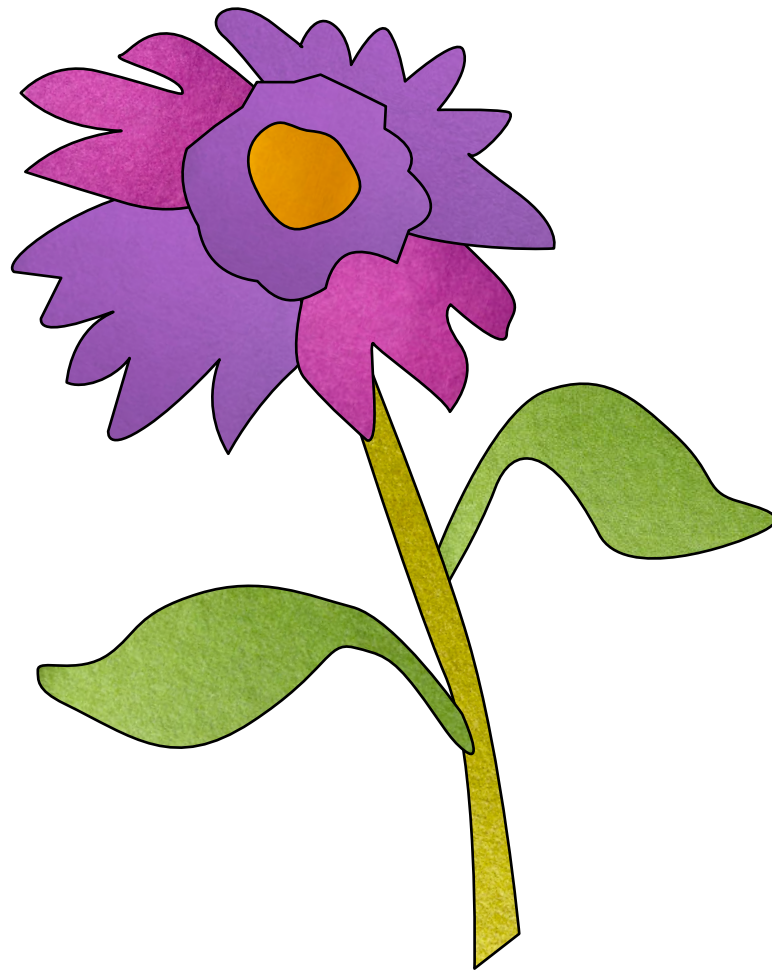
Bold Flower D - design 229 of 365