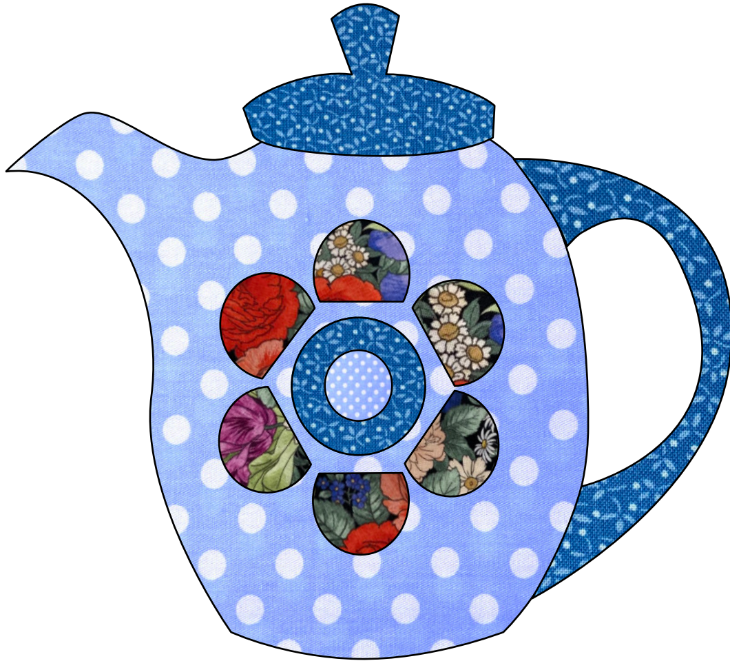
Teapot E - design 218 of 365