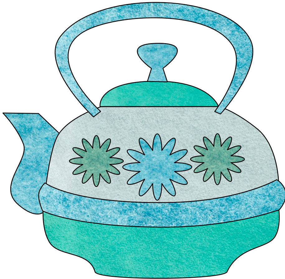
Teapot C - design 216 of 365