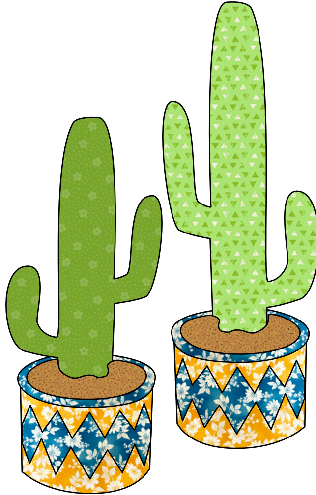
Cactus A - design 208 of 365