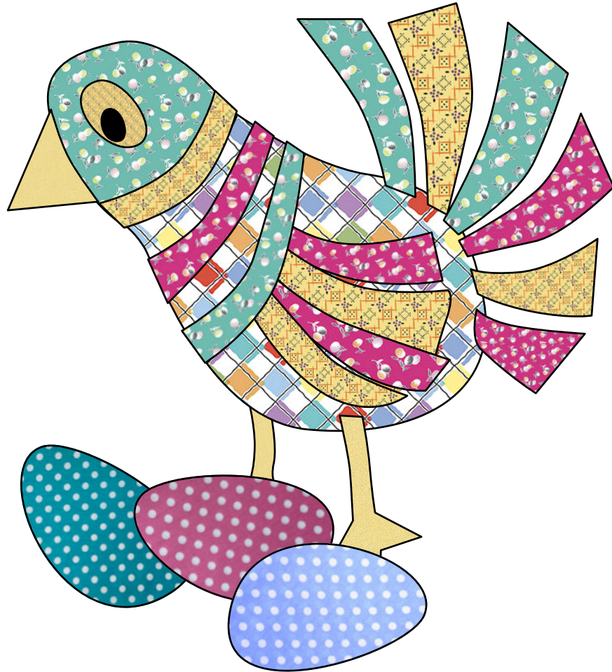
Silly Bird C - design 204 of 365