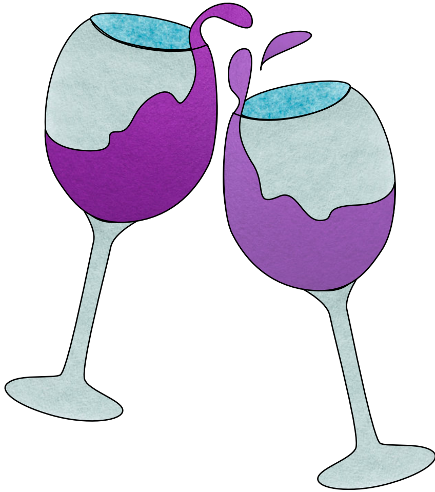
Wine A - design 190 of 365