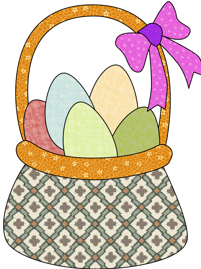
Easter B - design 185 of 365