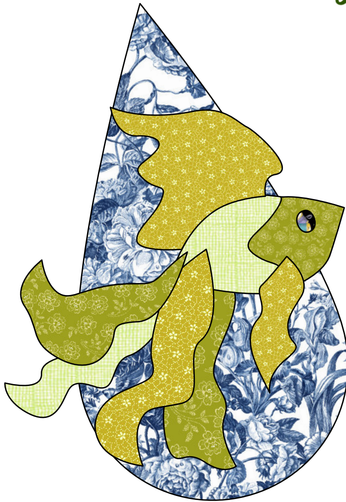
Aquatics E - design 176 of 365