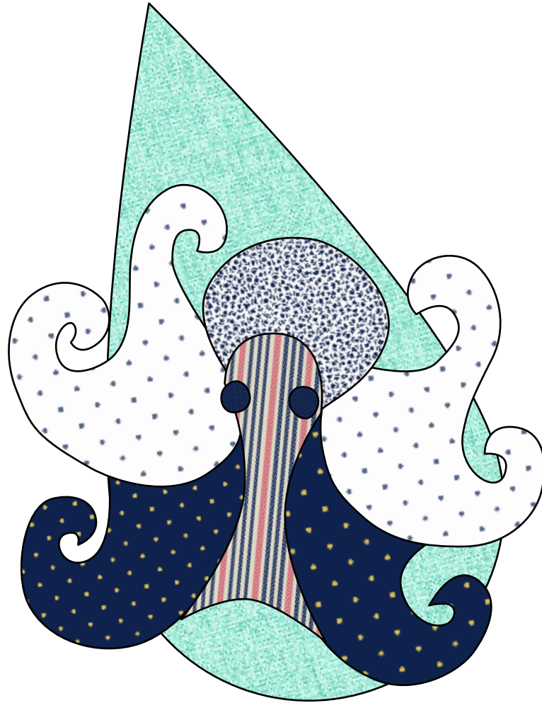
Aquatics B - design 173 of 365