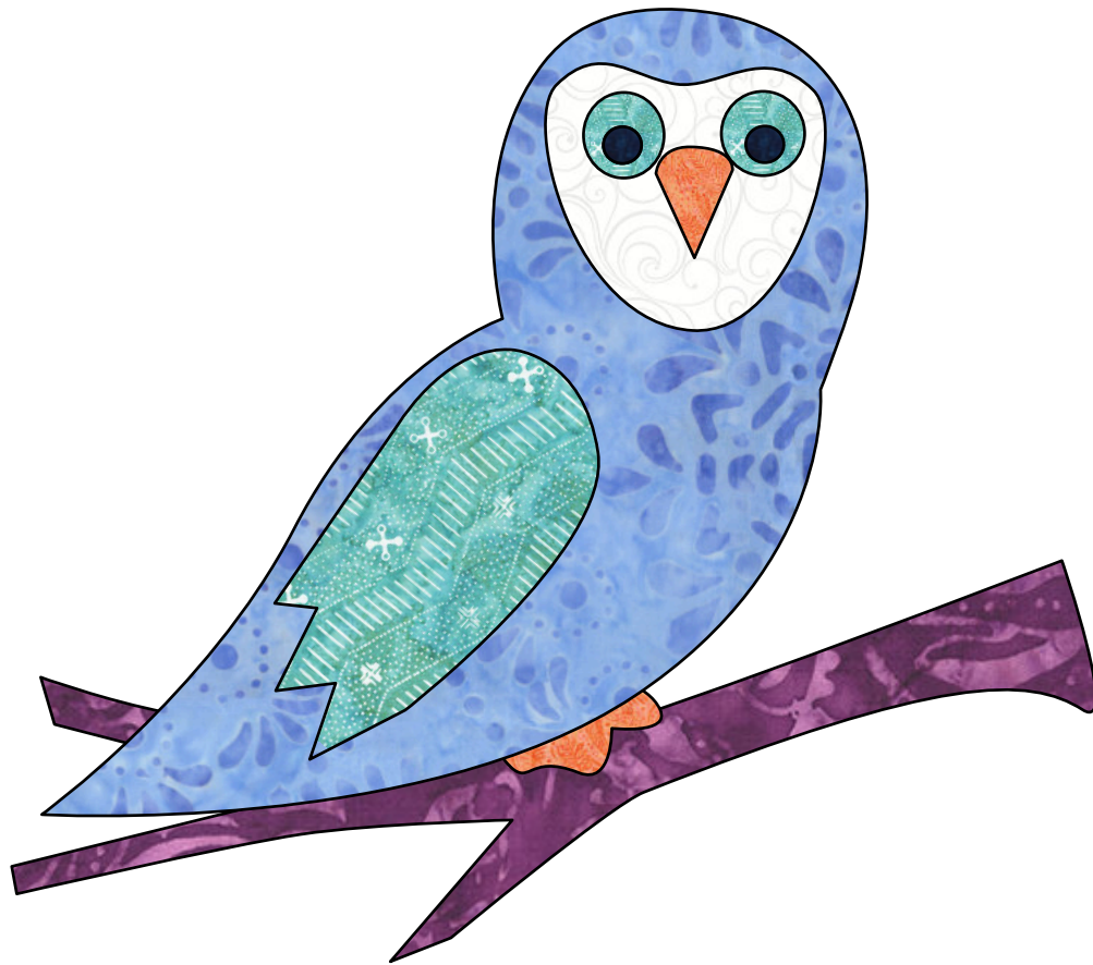
Owl B - design 133 of 365