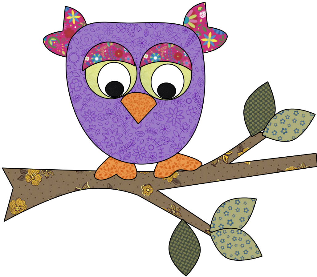
Owl A - design 132 of 365