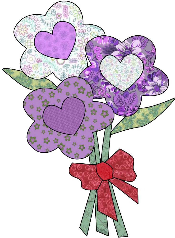
Valentine C - design 130 of 365