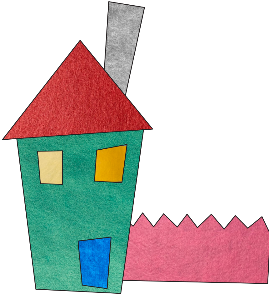
Houses A - design 100 of 365