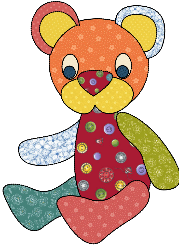
Stuffed Toys F - design 93 of 365