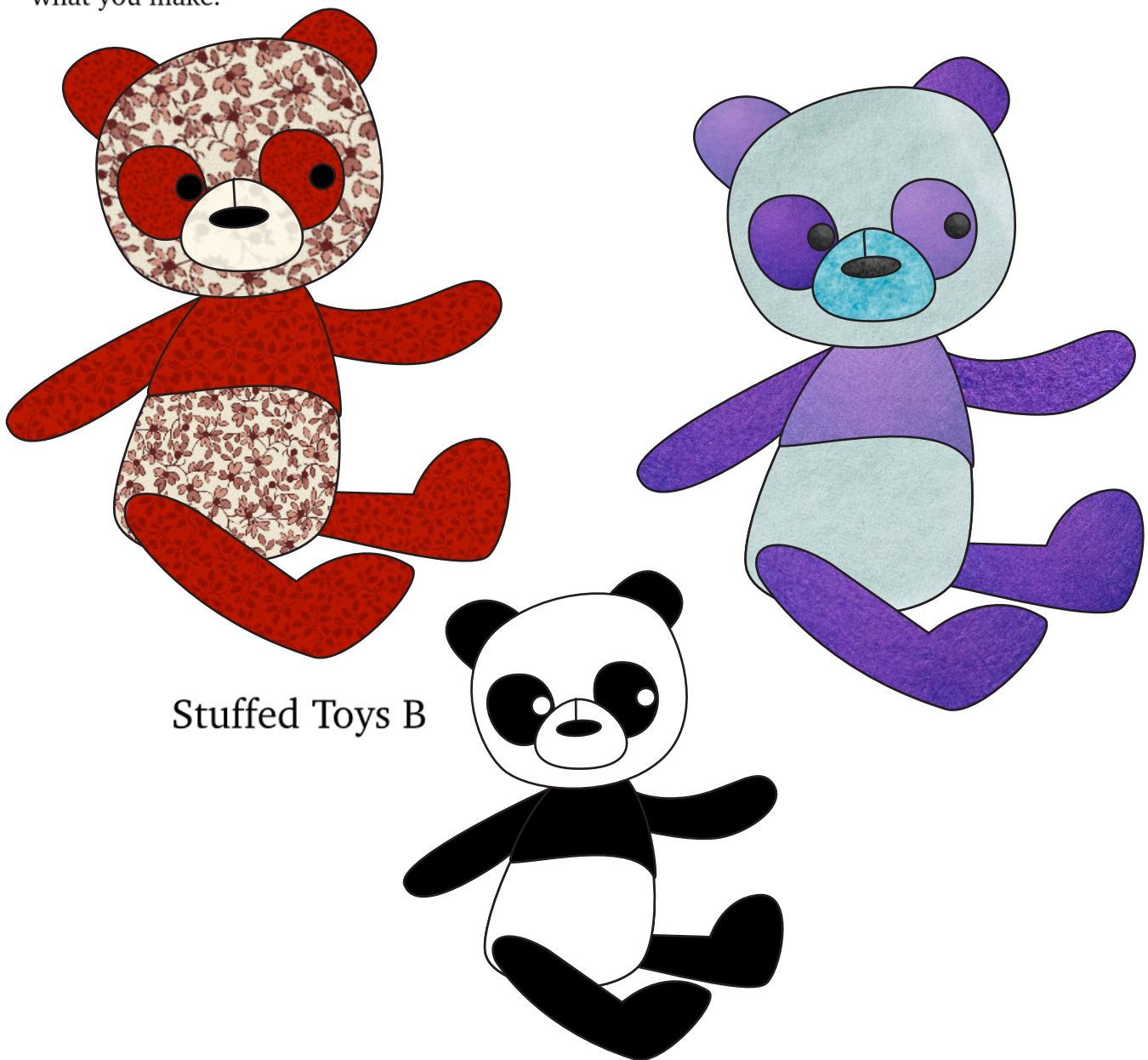
Stuffed Toys B

Each design includes full color images to give you an idea of what it could look like, plus a full size placement guide and full size pieces to trace. (You can also print them out larger or smaller if you need to.) Please share your creations on our social media, or email us, we'd love to see what you make.