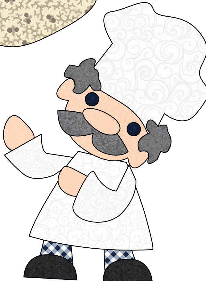
Chef C - design 70 of 365