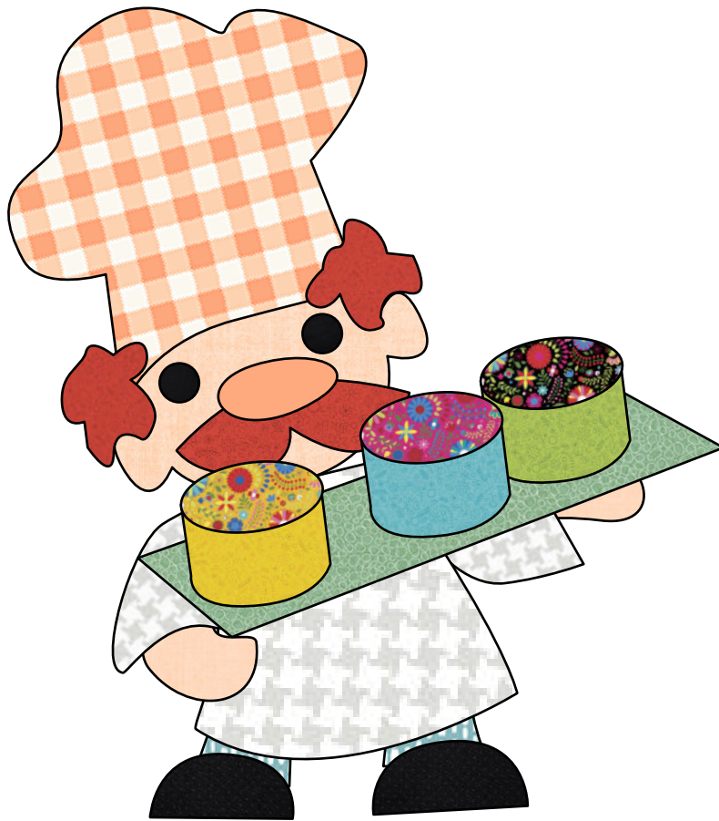
Chef A - design 68 of 365