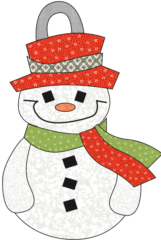
Ornament E - design 66 of 365