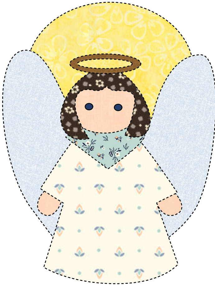
Christmas F - design 52 of 365