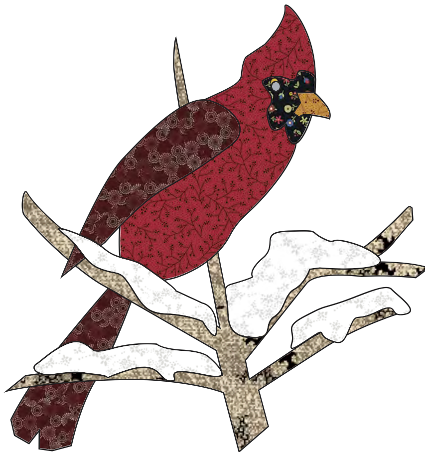
Winter J - design 40 of 365