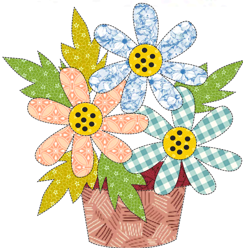
Flower E - design 36 of 365