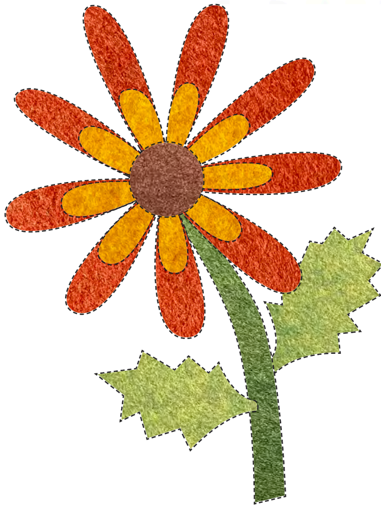
Flower B - design 33 of 365