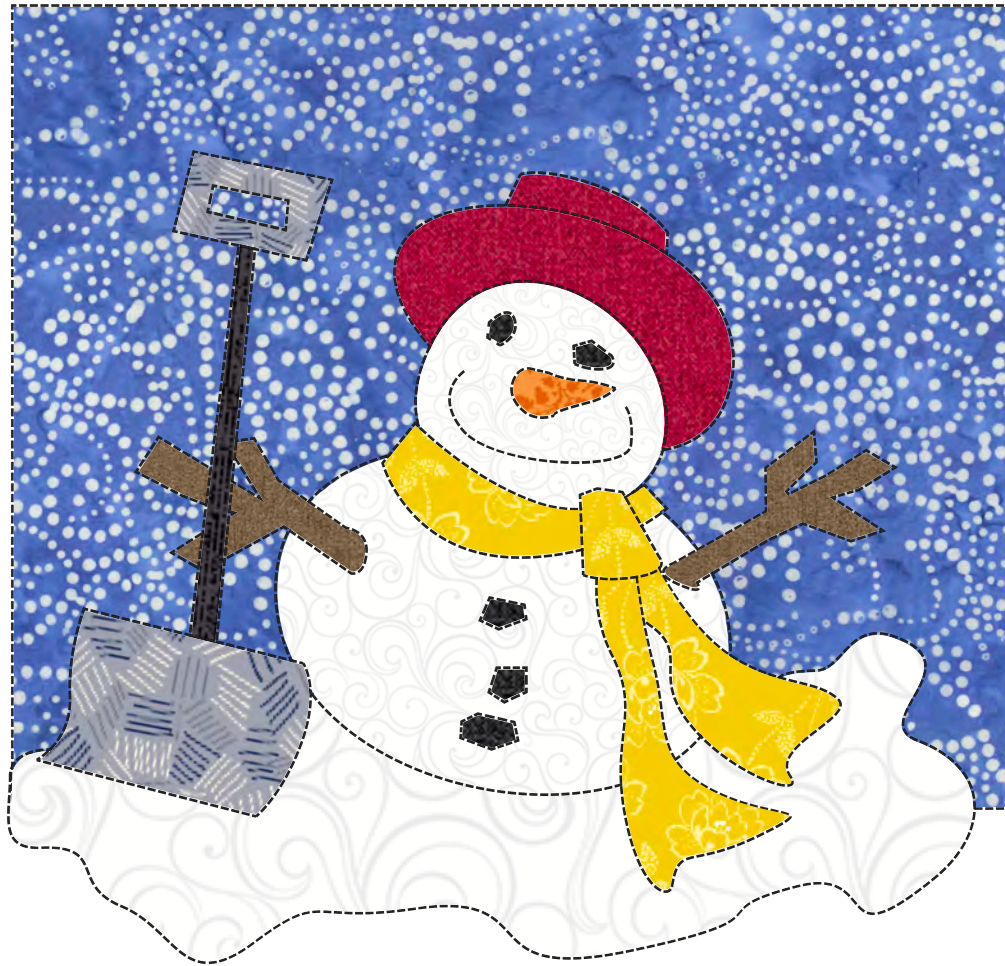
Winter A - design 25 of 365