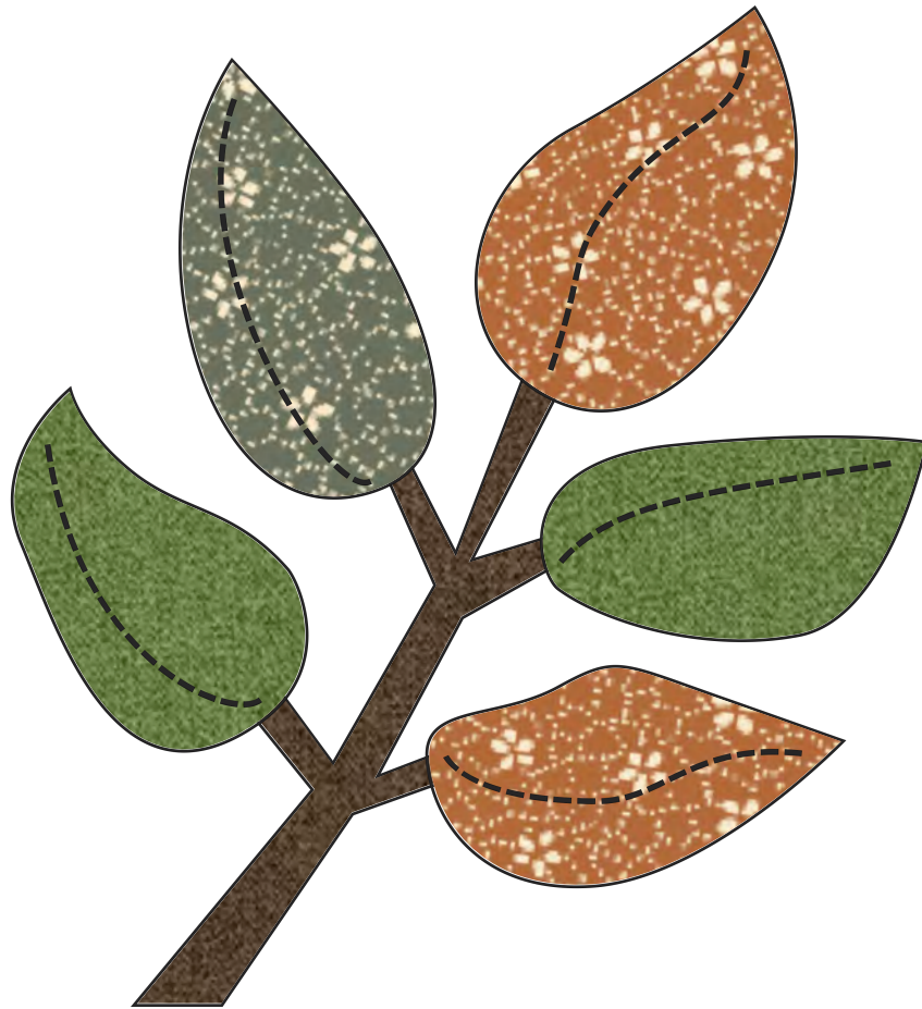
Autumn F - design 12 of 365