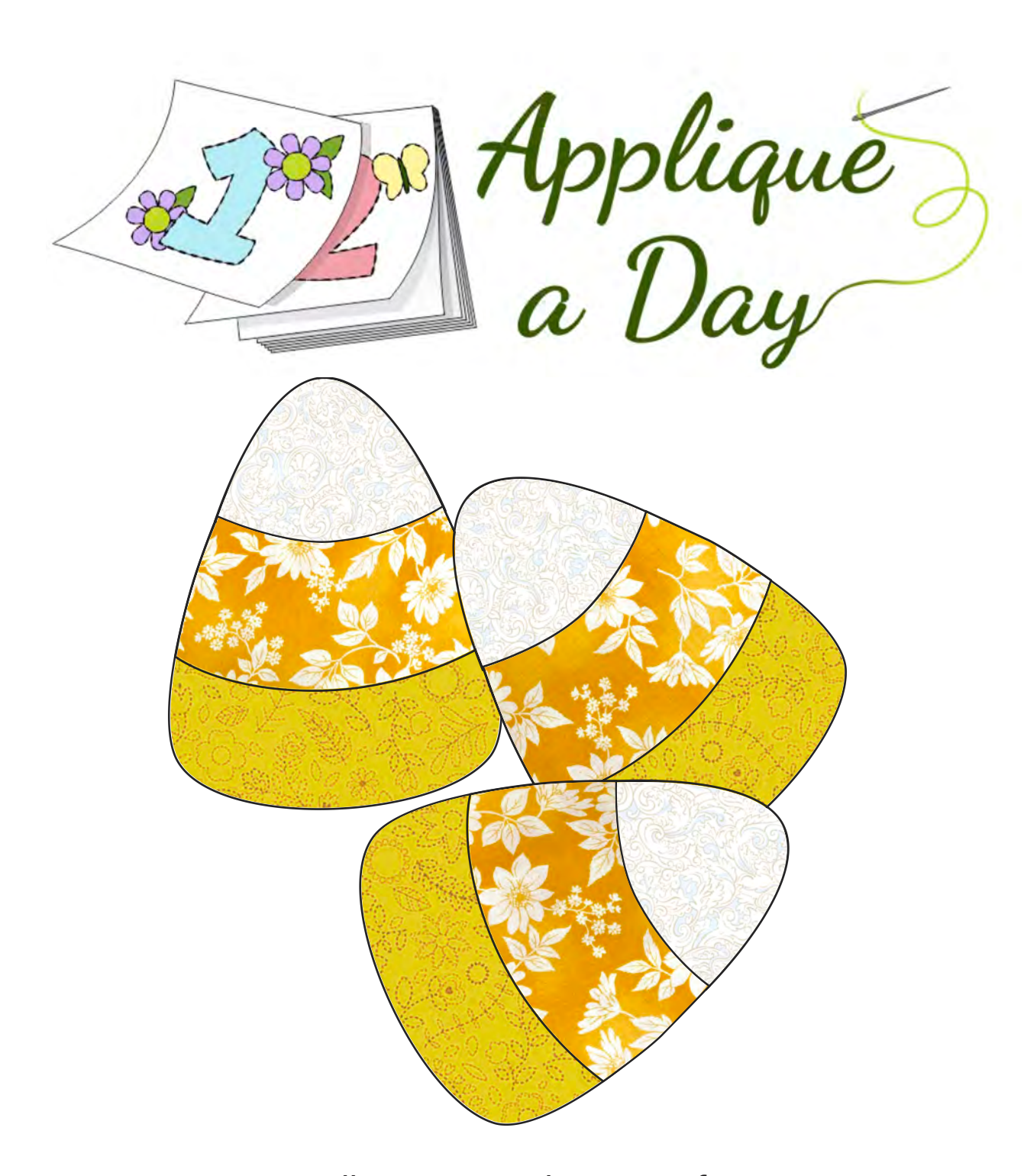
Halloween F - design 6 of 365