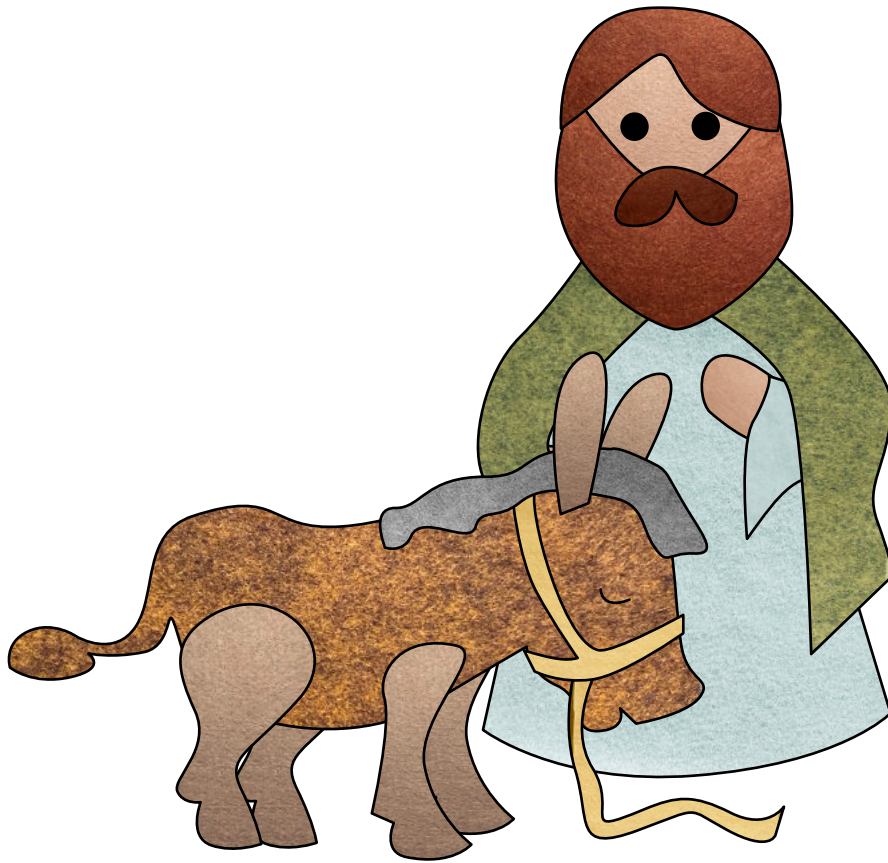
Nativity B - design 348 of 365