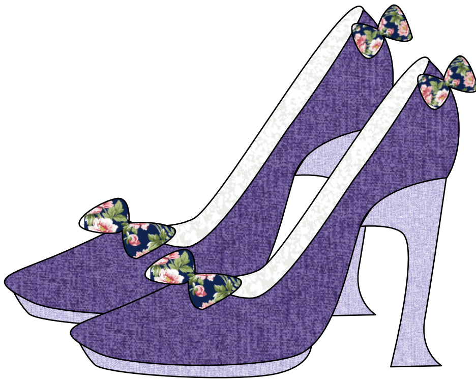
Fashion A - design 339 of 365