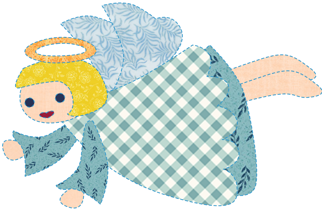
Ornament D - design 65 of 365